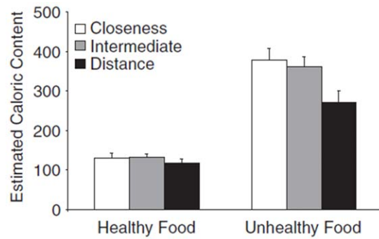
Figure 3. Results of Williams and Bargh (2008). doi:10.1371/journal.pone.0042510.g003

The present work attempted two fairly exact replications of studies reported by Williams and Bargh (2008). Neither study supported the original results. This naturally raises the question: why are these two studies yielding discrepant outcomes?